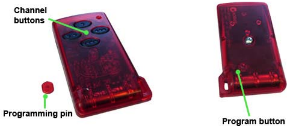
Transmitter (back and front) and the included programming pin

Grifco Transmitter (GT4) and Maestro Receiver Card (MRC) Programming Guide Rev: 706070